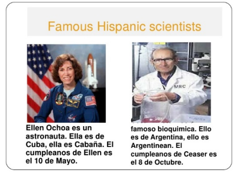
Proud to be Latin X