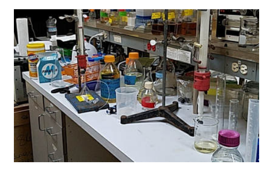
Science Lab: Biology Chemistry etc.