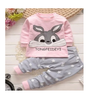
Baby Clothes Exchange