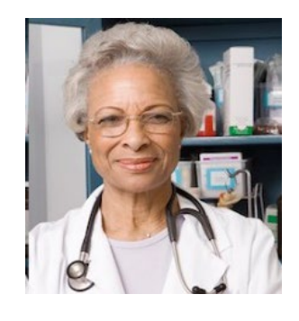
1. Health and Counseling