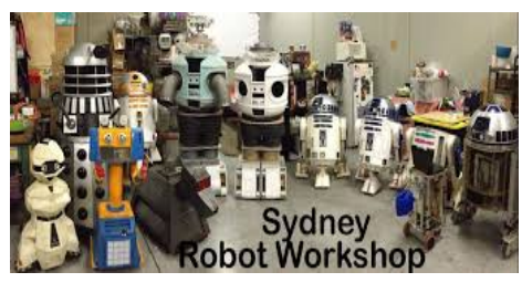
☐ Engineering-Robot Workshop