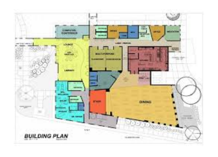
□ Community Center