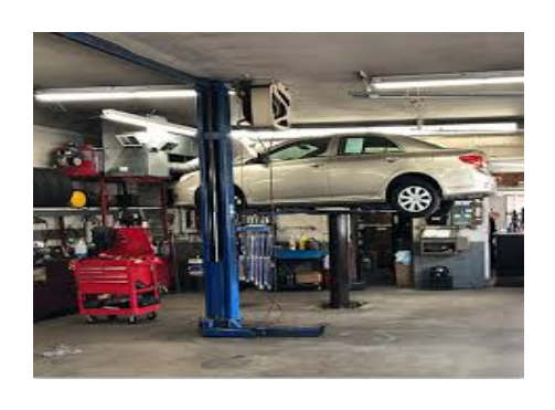
☐ Community Auto Repair Shop