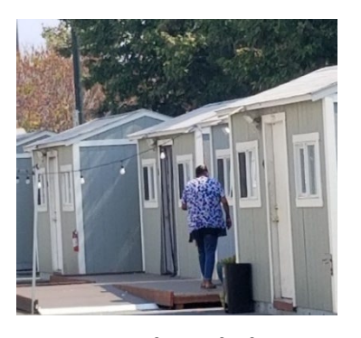
☐ Homeless Shelters